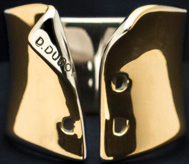
CORSET GOLD & SILVER RING