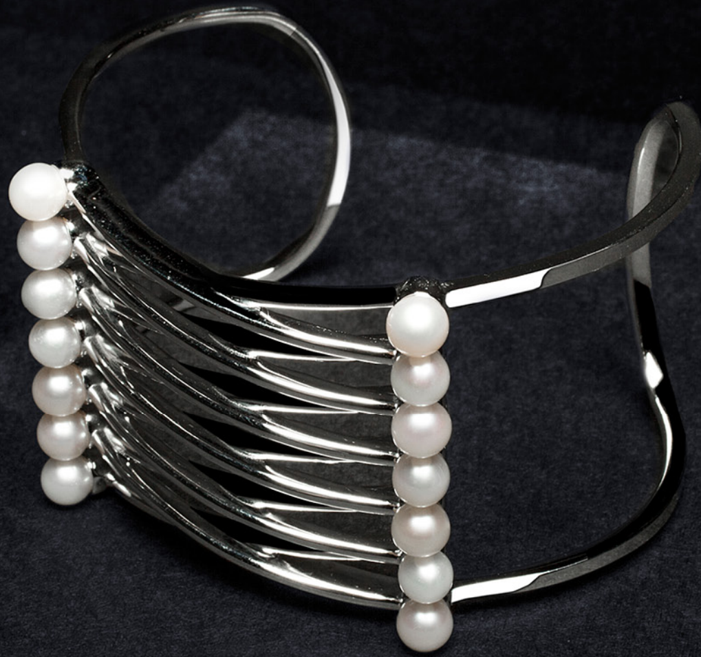
DENTELLE SILVER & PEARL BRACELET