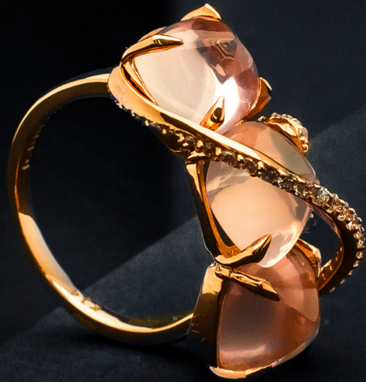
GRIFFE GOLD DIAMOND QUARTZ RING