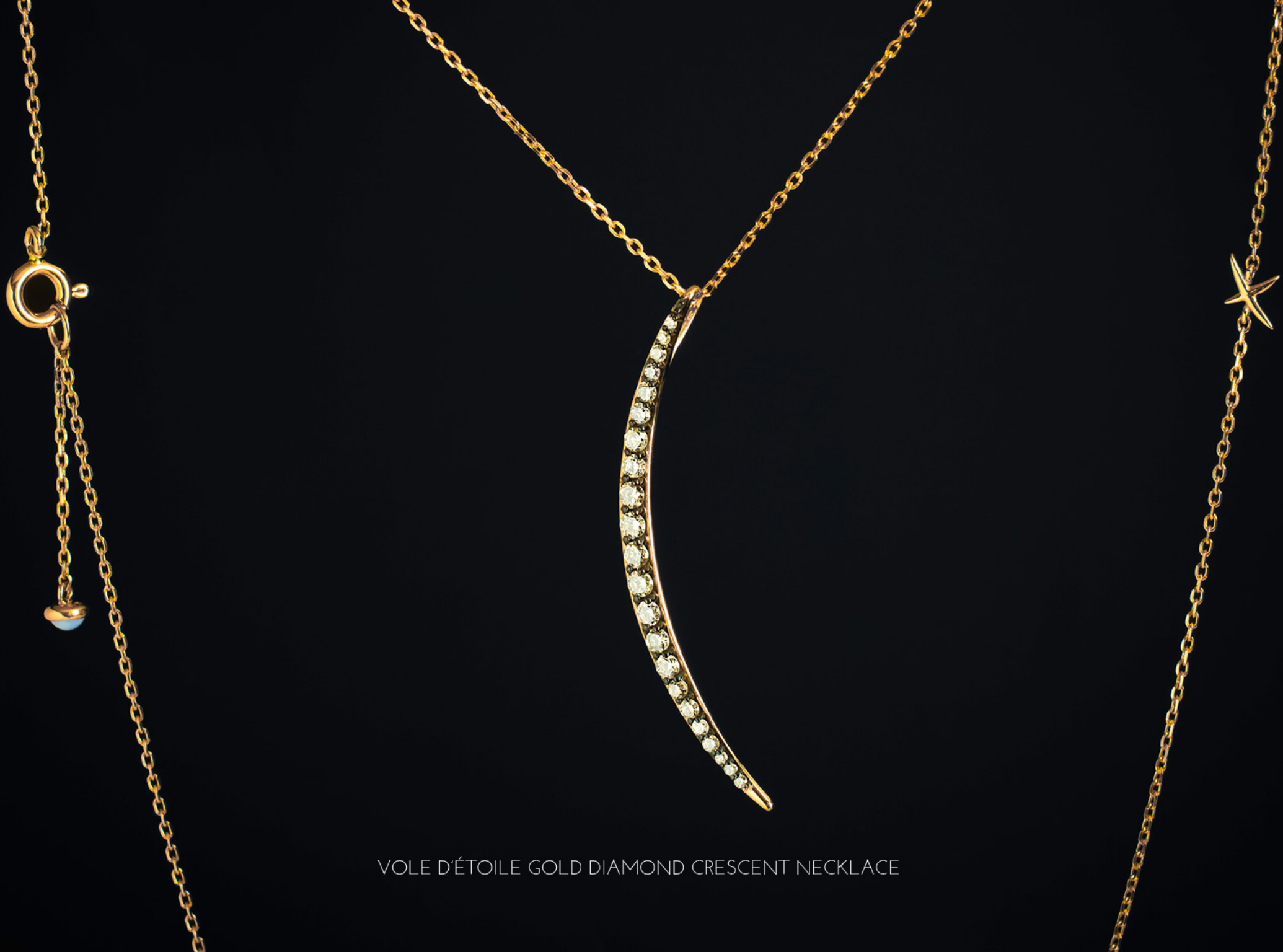
VOLE D'ÉTOILE GOLD DIAMOND CRESCENT NECKLACE