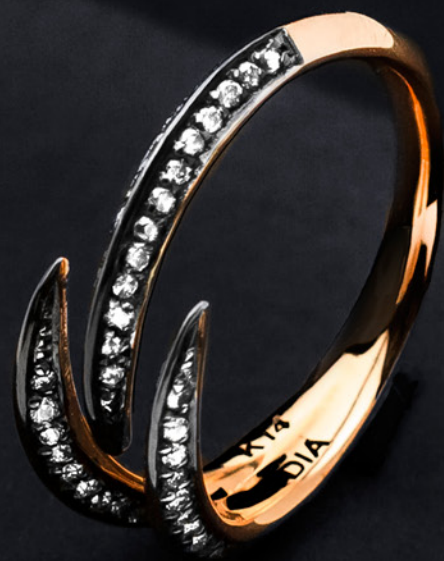
GRIFFE GOLD DIAMOND RING