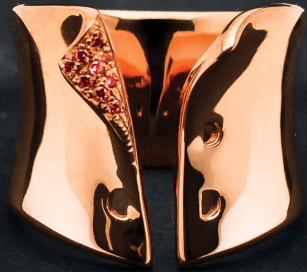
CORSET GOLD SAPHIRE RING