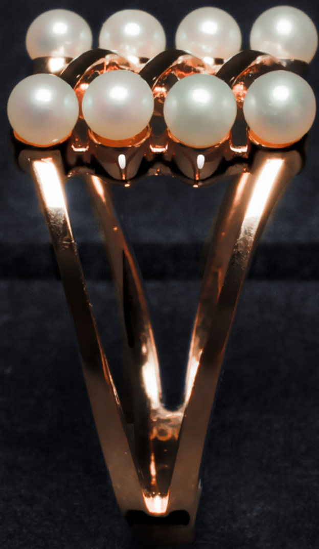
DENTELLE GOLD & PEARL RING