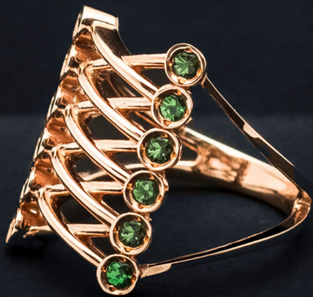
DENTELLE GOLD TSAVORITE