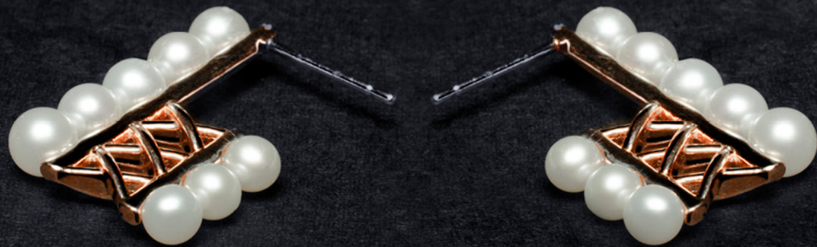
DENTELLE GOLD & PEARL EARING