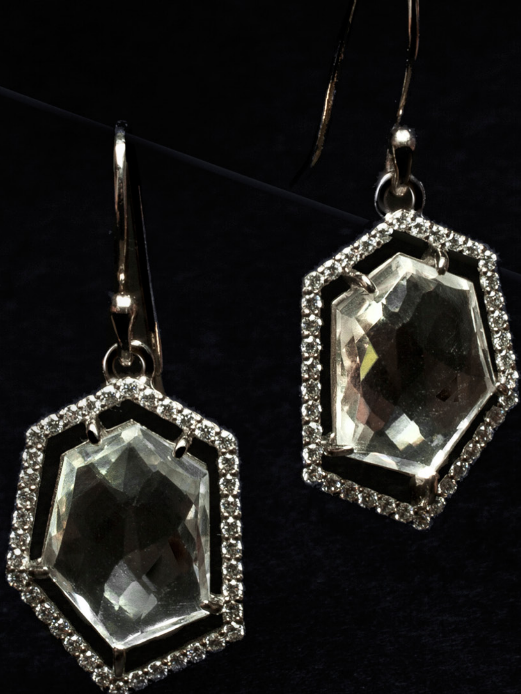
PÉPITE ÉTINCELLE SILVER TOPAZ EARING