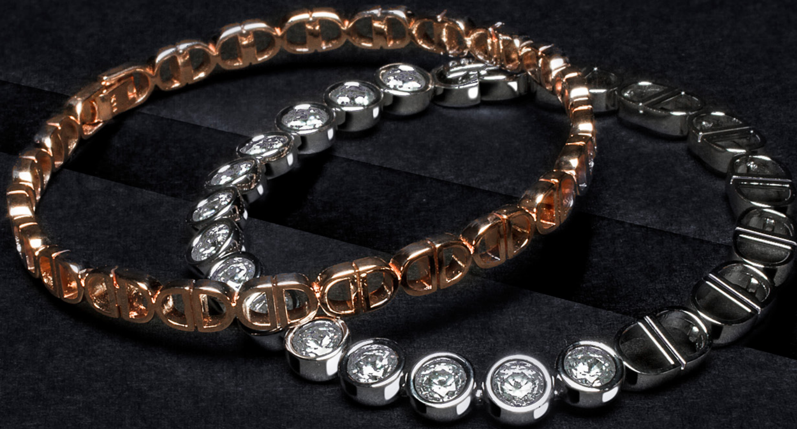
TWIN D BRACELET