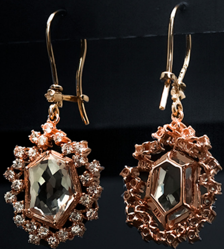
PÉPITE ÉTINCELLE EARRING