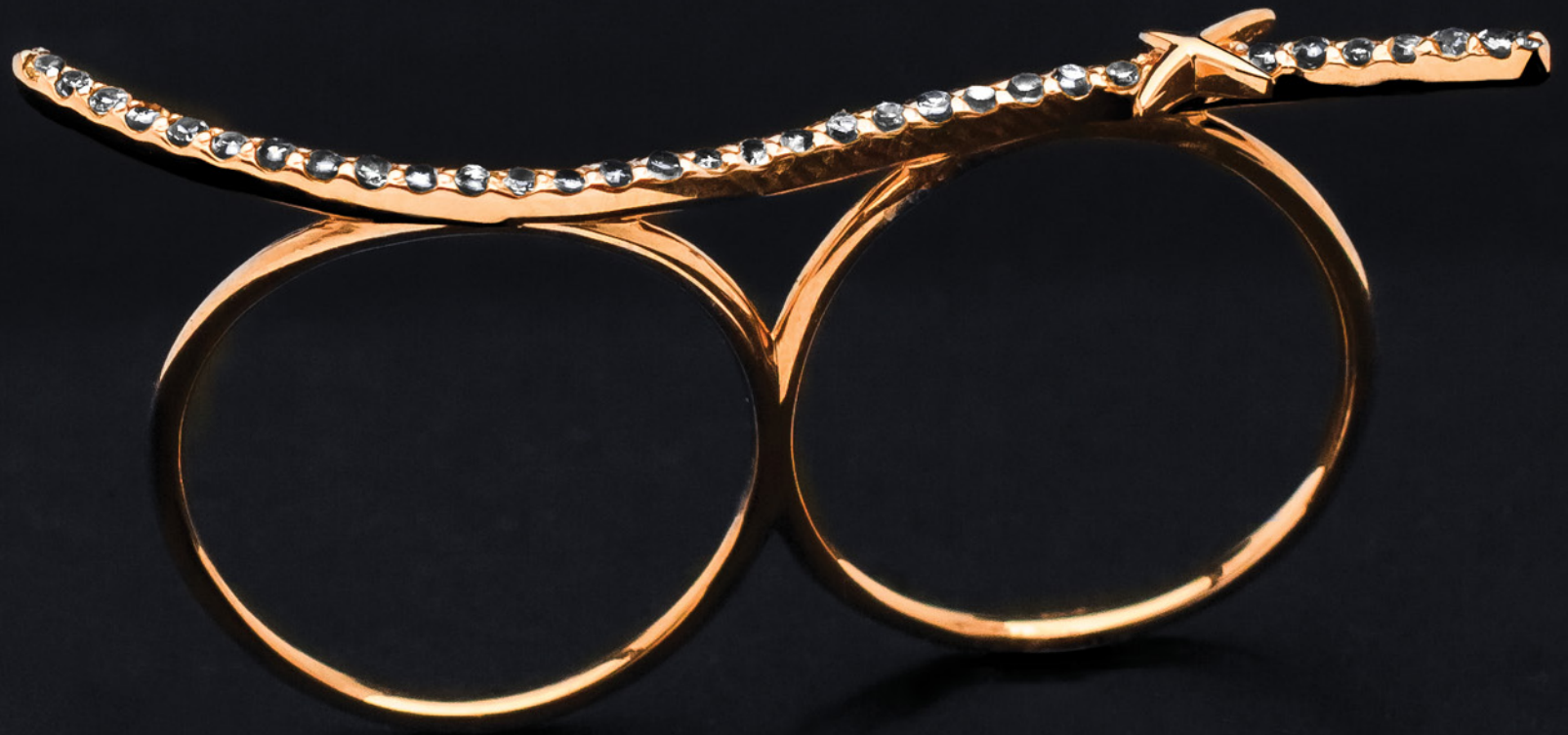
VOLE D'ÉTOILE TWIN GOLD RINGS