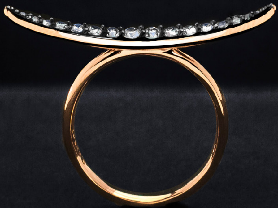
GRIFFE SOLITAIRE RING