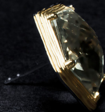
PÉPITE SOLITAIRE GOLD TOPAZ EARING