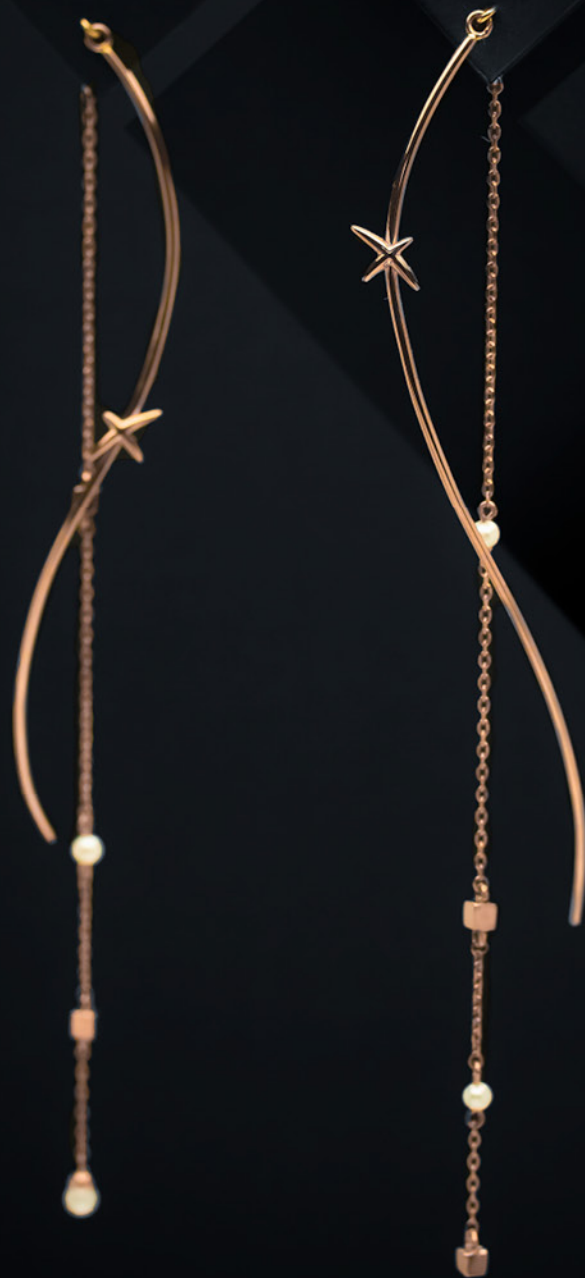
VOLE D'ÉTOILE GOLD PEARL EARRING