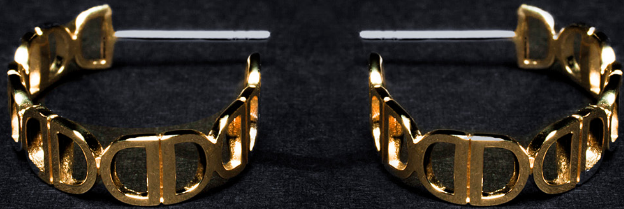
TWIN D EARING