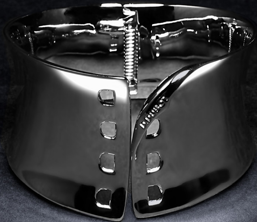
CORSET SILVER BRACELET