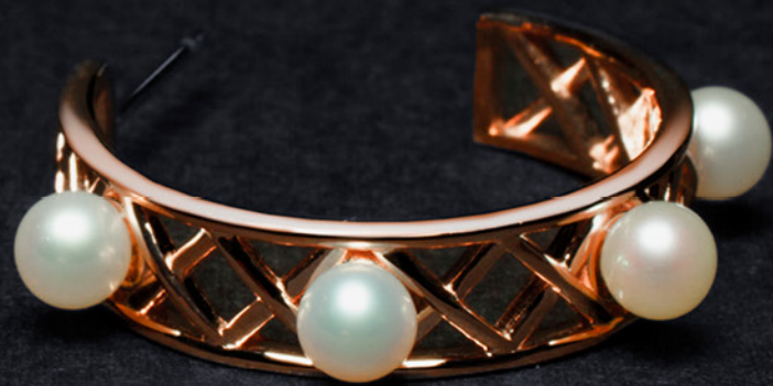
DENTELLE GOLD & PEARL ARC EARING