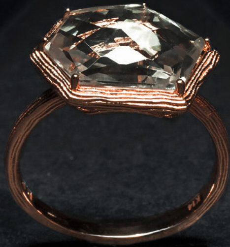
PÉPITE SOLITAIRE TOPAZ RING