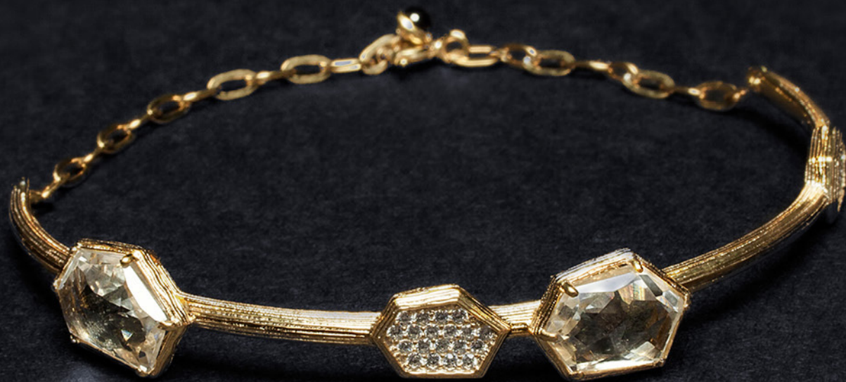
PÉPITE GOLD TOPAZ BRACELET