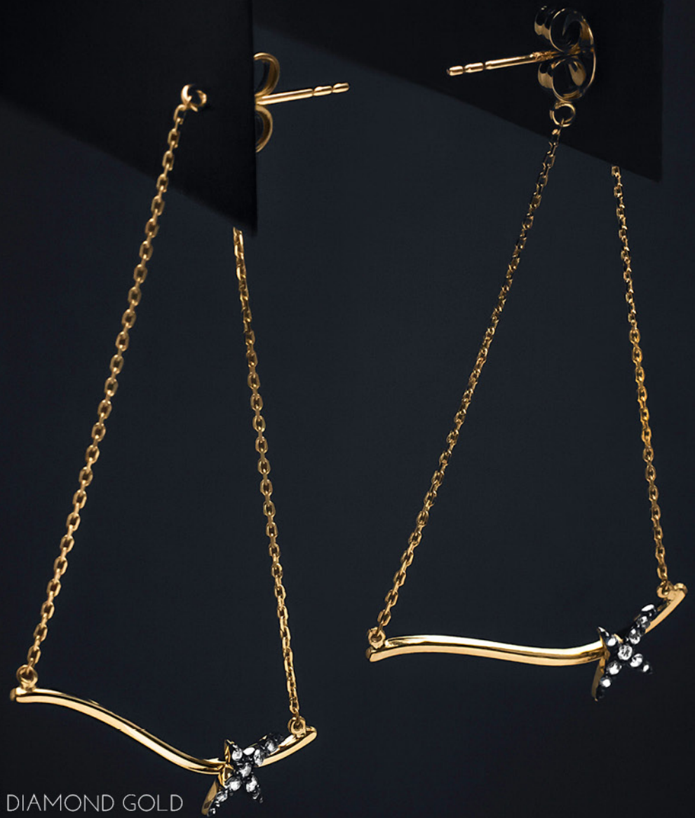
VOLE D'ÉTOILE DIAMOND GOLD