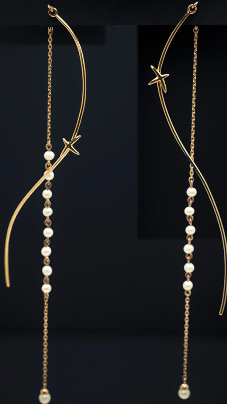
VOLE D'ÉTOILE GOLD PEARL DROPS EARRING