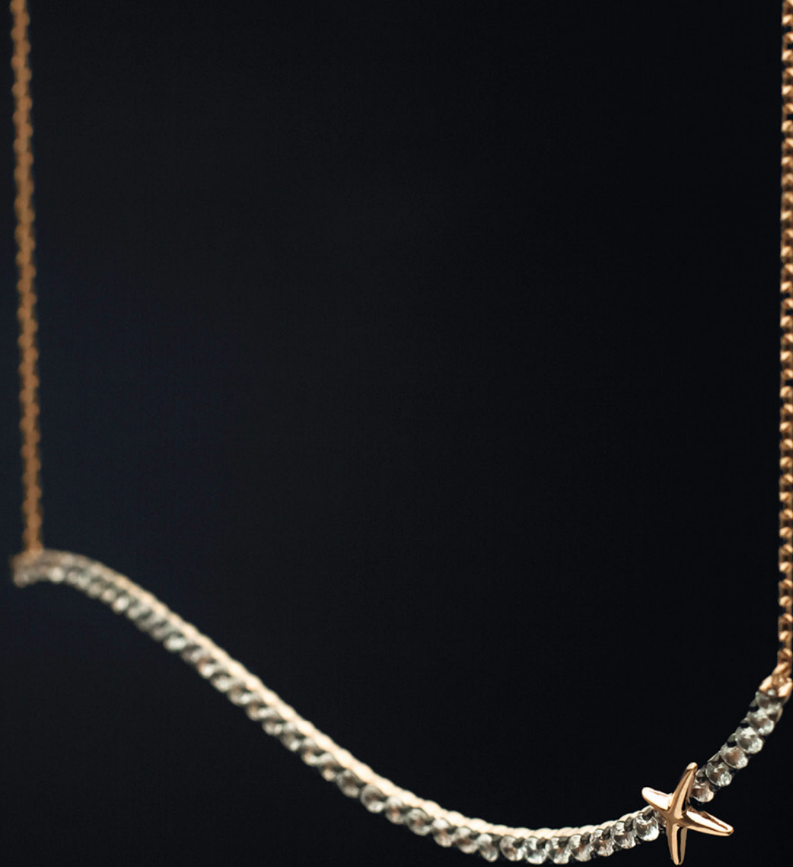
VOLE D'ÉTOILE DIAMOND COMÈTE NECKLACE