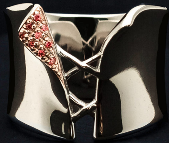
CORSET AND DENTELLE SILVER RING