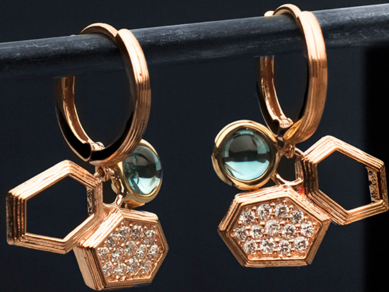
PÉPITE CONSTELLATION EARRING