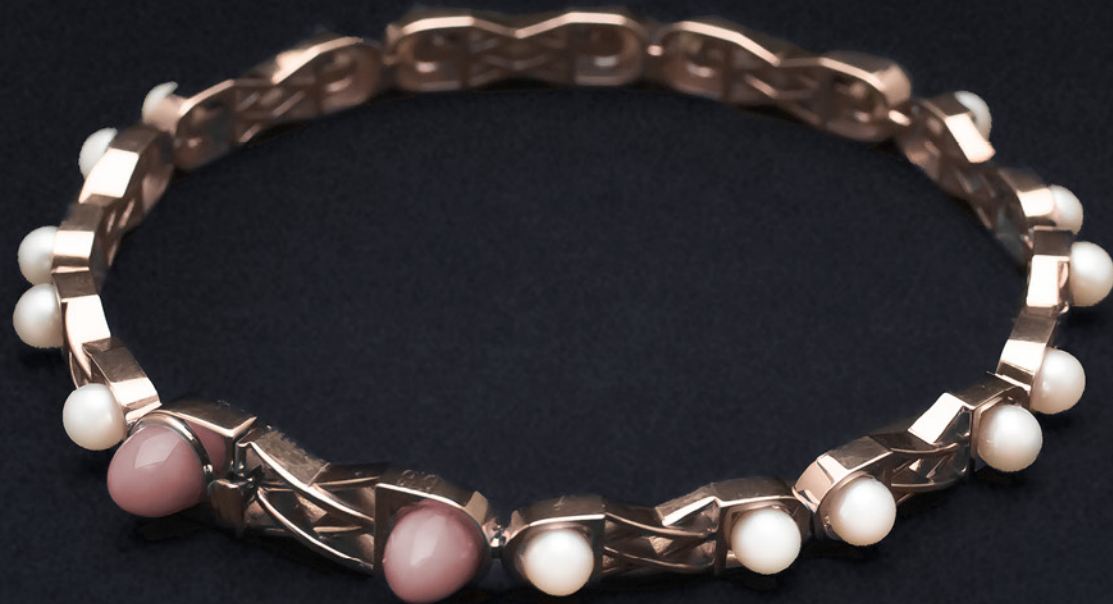
DENTELLE GOLD & PEARL BRACELET