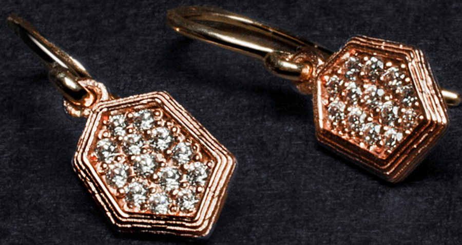
PÉPITE CONSTALLATION GOLD SAPHIRE EARRING