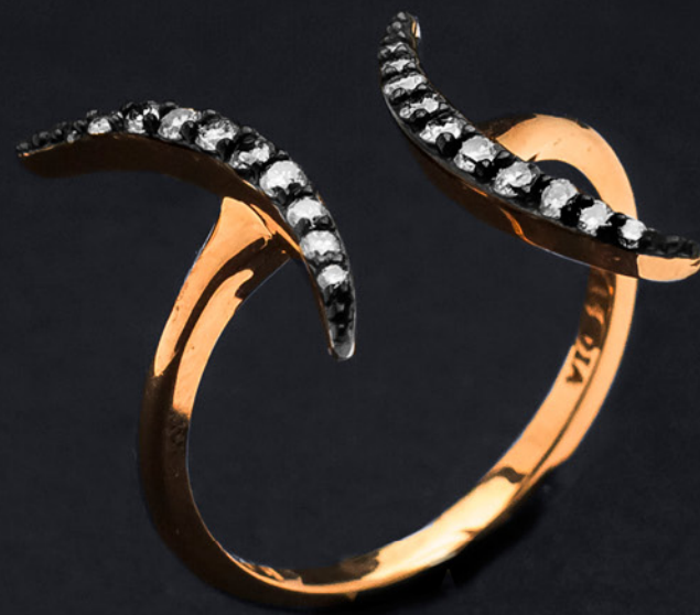
GRIFFE CROISSANT LUNE RING