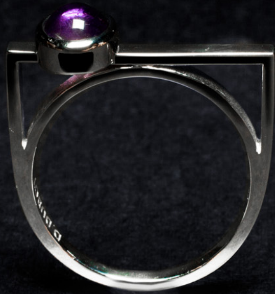
D SOLITAIRE RING